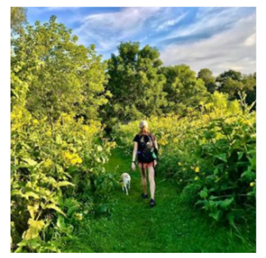
Donald County Park @baileyser