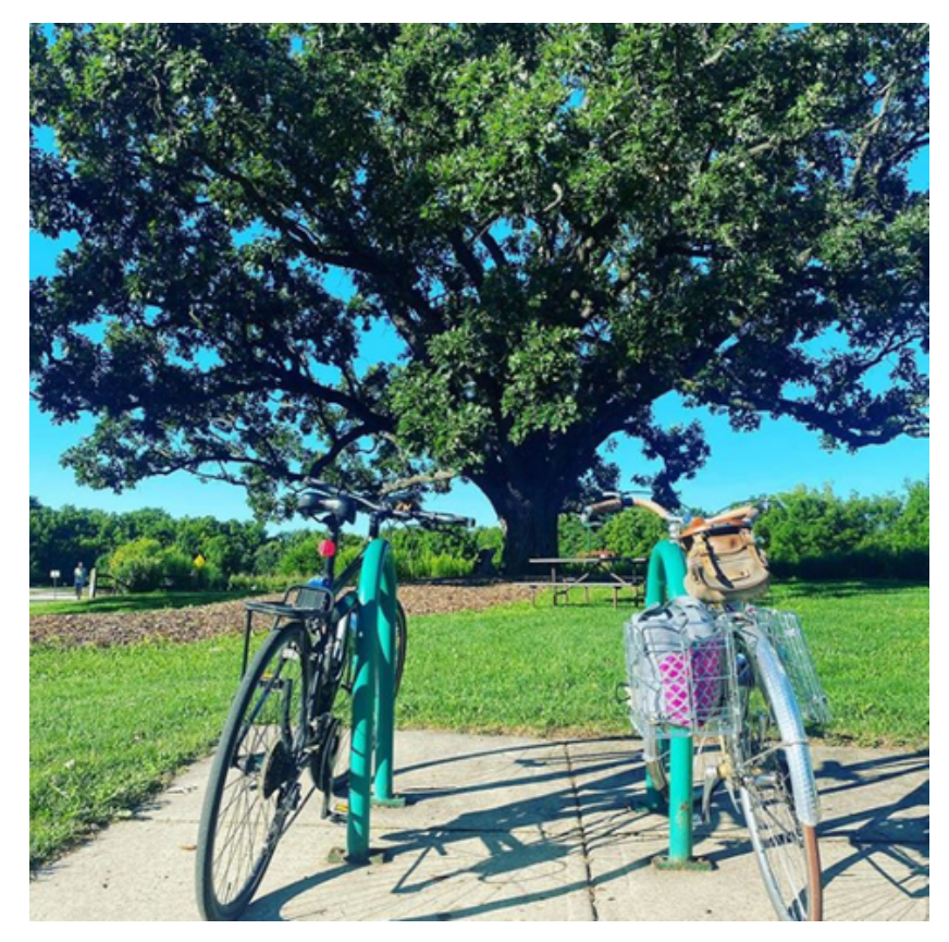
Lussier Family Heritage Center @beetandbean_2018