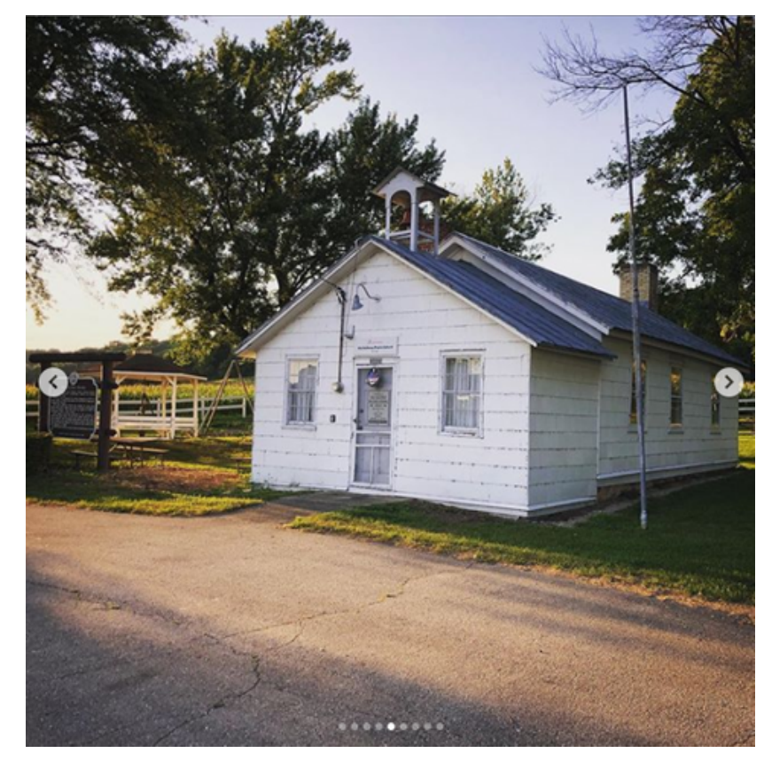
Old Halfway Prairie School